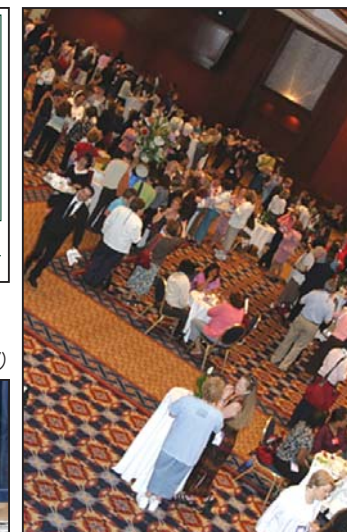
API Reception (NTI 2007)