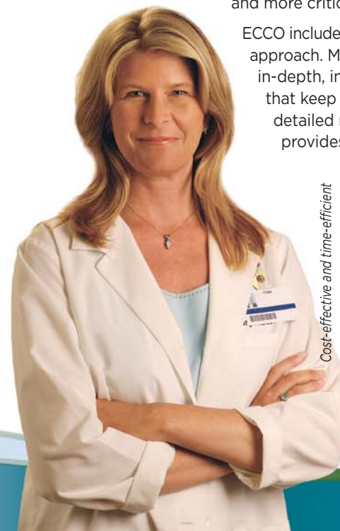
Cost-effective and time-efficient

ECCO includes 10 learning modules, organized using a body systems approach. Modules are comprised of multiple lessons that provide in-depth, interactive content with rich graphics and illustrations that keep learners engaged. Body system modules include a detailed review of anatomy and physiology. The course provides a total of 69 hours of CNE credit.